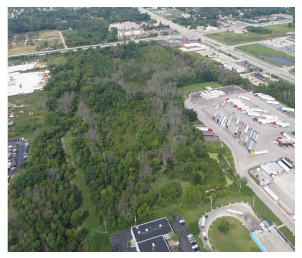
Significant stands of trees are dying because of invasive insects and diseases that are rapidly spreading across the United States. Communities are losing the significant environmental, economic, and social benefits landscape and forest trees provide.

Nonnative forest pests, such as wood-boring beetles, are estimated to cost nearly $1.7 billion in local government expenditures and approximately $830 million in lost residential property values annually (Aukema et al. 2011). Despite efforts to exclude new introductions through quarantine measures, the number of invasive and potentially highly destructive species established worldwide will continue to grow (Aukema et al. 2010). Invasive species increasingly are spread between continents by expanding world trade markets and other human influences related to increased worldwide travel and containerized cargo transport. Once these species invade, they are spread further by the movement of infested plants, firewood, and other articles harboring insects or diseases.