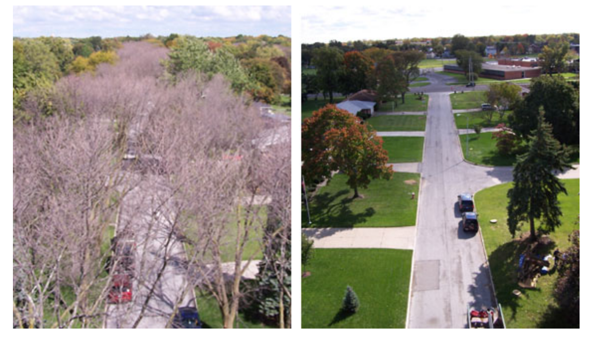
Due to an EAB infestation, the entire character of this street and neighborhood in Toledo, Ohio, was dramatically changed in less than two years. Without the mature trees, real estate values, stormwater and particulate matter capture, and local air quality will decrease, and home energy costs will increase.

Emerald ash borer has killed millions of ash trees since its discovery in the U.S., and the number of dead ash is increasing rapidly. Ash species are abundant in both planted and natural areas of urban forests, representing 10 to 40 percent of the canopy cover in many communities. Consequently, widespread ash mortality in urban forests and residential landscapes is having devastating economic and environmental impacts. EAB is predicted to cause an unprecedented $10–20 billion in losses to urban forests over the next 10 years (Kovacs et al. 2009).